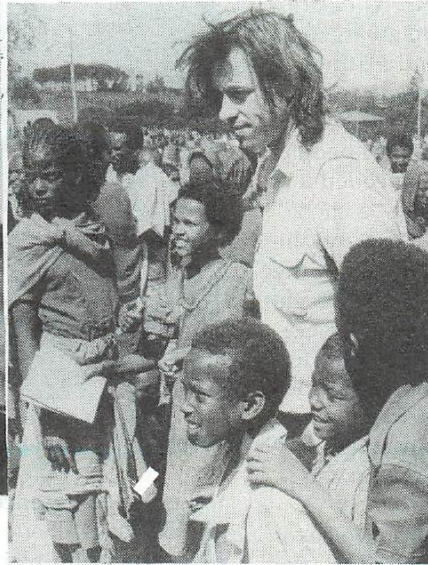
The Dalai Lama (above), Bob Geldof (right), and Pope John Paul II (below)