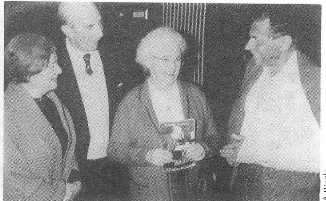
Two of the cast of 'Keir Hardie—the man they could not buy' meet a couple from the audience (centre) after a performance in Sydney

For the last few years initiatives of the Spirit at local and national level have drawn people to Latin America. Recently in response to requests from Central America, an international group with extensive experience of how God can change lives and situations spent two weeks in El Salvador, Guatemala, Costa Rica and Nicaragua. (We shall carry a full report in our first issue of 1986). Their visit concluded with a