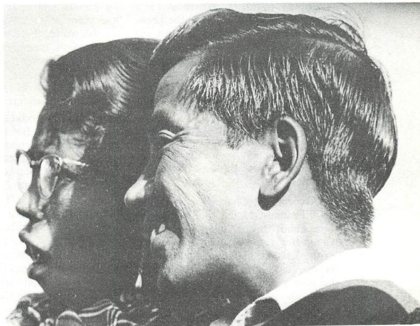
People of the Khasi Hills at a Moral Re-Armament meeting