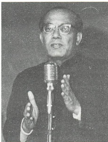
Chief Minister B P Chaliha

After anxious discussion the Indian Government conferred a measure of autonomy on the Hills Peoples which was accepted by both the Plains and Hills Peoples. Leaders of both groups