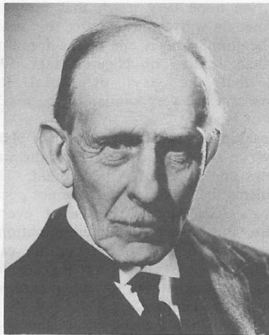
The fourth Marquess of Salisbury