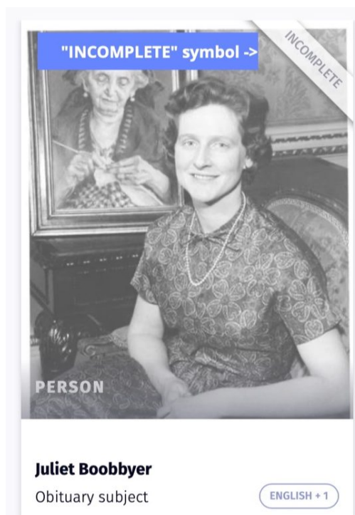
Image: “card” on For A New World showing the “incomplete” ribbon in the top right corner.

To indicate this, we've added a symbol in the shape of a “ribbon” at the top right corner of the cards, see example to the right. Hopefully, this will make it clearer to visitors what they can expect when clicking a card.