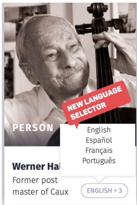
Image: "card" on For A New World showing the new language pop-up in the bottom right corner.

We have added this page where you can explore pages in your preferred language. Go to it and choose your language; you will find all the pages on the website available in this language.