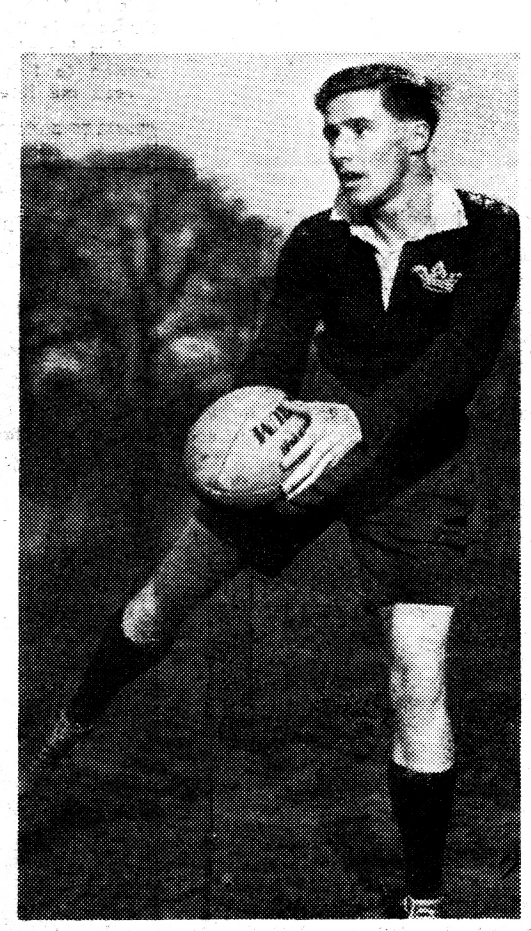
The writer, on the Rugby field.

We in Britain feel it will be for the good of the are if the Springboks are occasionally defeated. Already "the Boot" has become a household name; Muller's qualities of leadership have earned high praise; and all the half-backs, especially Brewis, have made names for themselves; many have still to find their feet on our green grounds. to find their feet on our grassy grounds. But the eyes of all rugby lovers are on them, and there can be no doubt that they will do themselves justice.