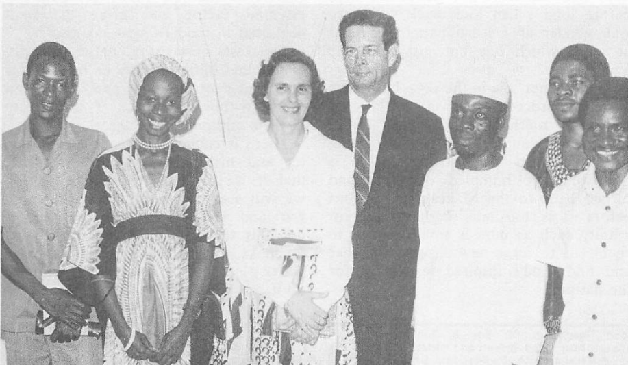
King Michael and Queen Anne with the cast who read their play 'The Choice'.