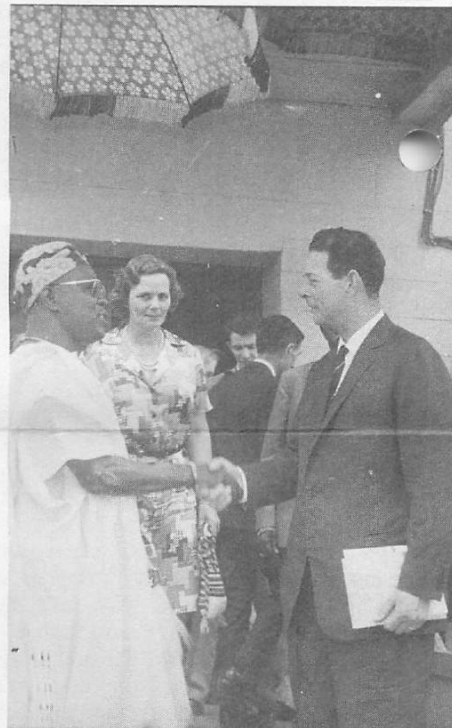
Welcomed to his palace by the Alake of Abeokuta Oba Onipede II.

BUILDING A HATE-FREE, FEAR-FREE, GREED-FREE SOCIETY Lagos Conference 28-30 March