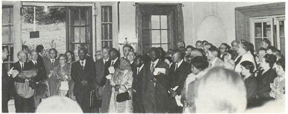
South African Homeland leaders are welcomed on arrival at Caux

Other Homeland leaders who have been attending the Caux Assembly include Chief Lucas Mangope, Chief