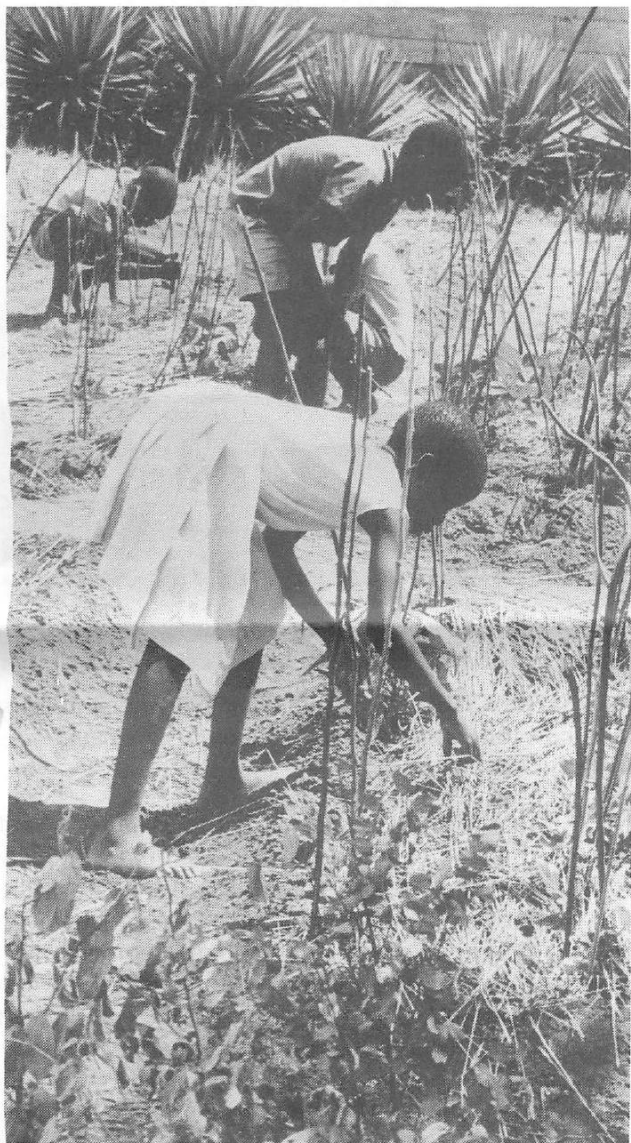
Zimbabwean children learn the basics of food production at a school in Bulawayo.