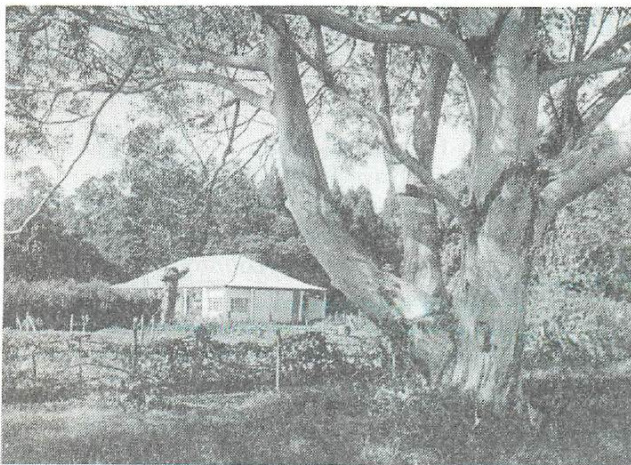
Coolmoreen, near Gweru, was given to Moral Re-Armament as a farm. 'The Future we long for' shows how Coolmoreen is giving elementary training in agriculture through its poultry unit and dairy herd. Seminars on health, industry and for young people seek to create the moral infrastructure for development.

FOR US THE CONFLICT between the rich and the poor is not a theoretical one. It's an immediate one. On one side we have conditions of abject poverty , on the other side of prosperity. If we are successful here in Zimbabwe in finding a solution to that problem by raising the living standards of the low-income community and moderating the living standards of people in my section of society then, I believe, we will be making a contribution.