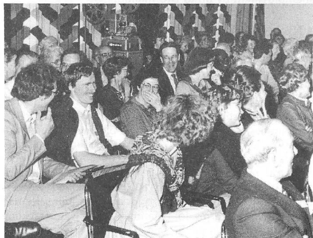
Woudschoten conference enjoys an evening of entertainment