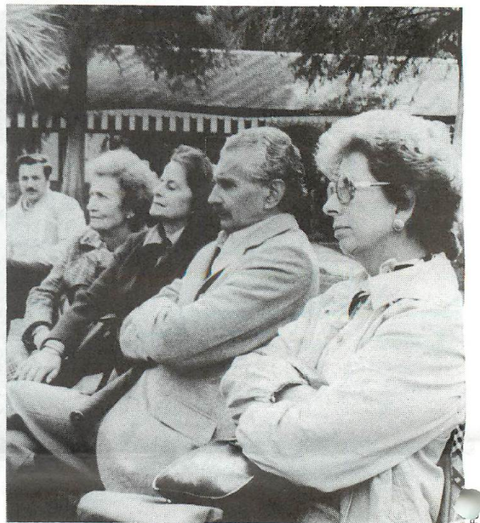
Argentine participants at a meeting

America had been told, when they said that MRA aimed to inspire creative self-help.