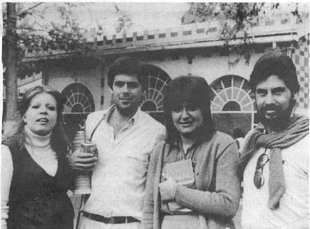
Uruguayans who took part in the play 'Porque no me escuchas?'