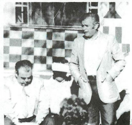
River Plate meeting...page 2