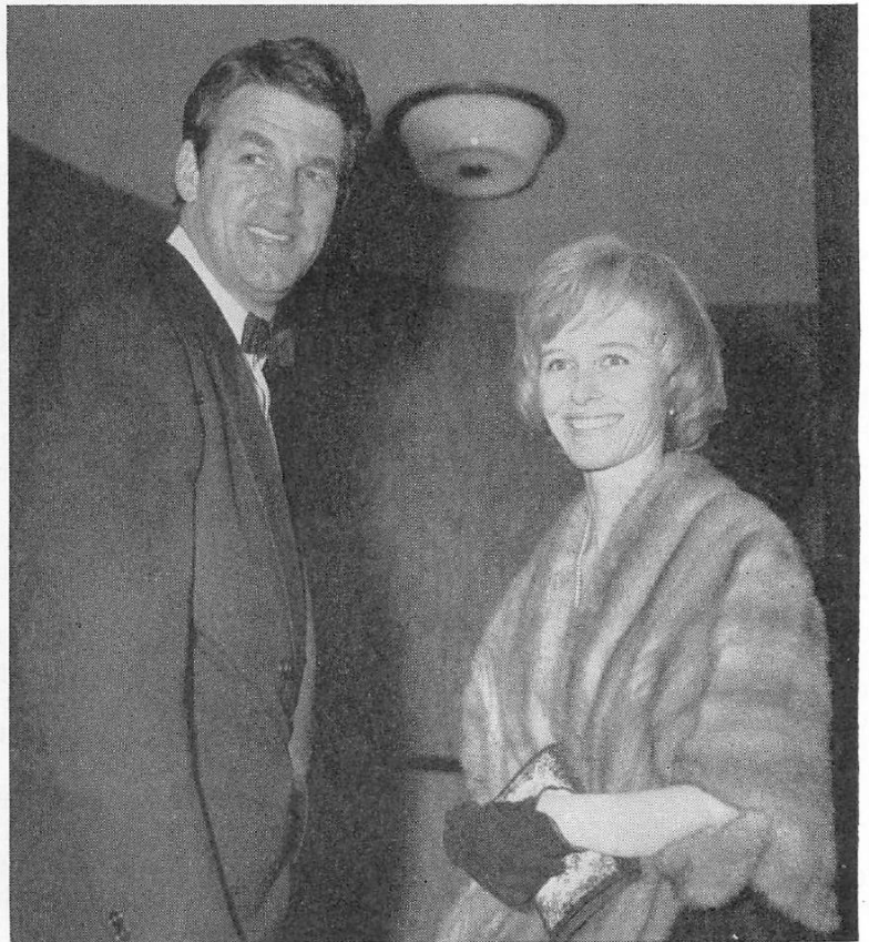
Film stars Bill Travers and Virginia McKenna at 'The Crowning Experience'

After singing a Negro spiritual, people rose to their feet and cheered. Three hundred and twenty stayed for an hour afterwards at a reception held in her honour.