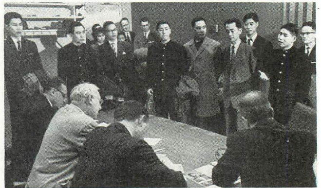
In the terminal they are interviewed by the airport press corps