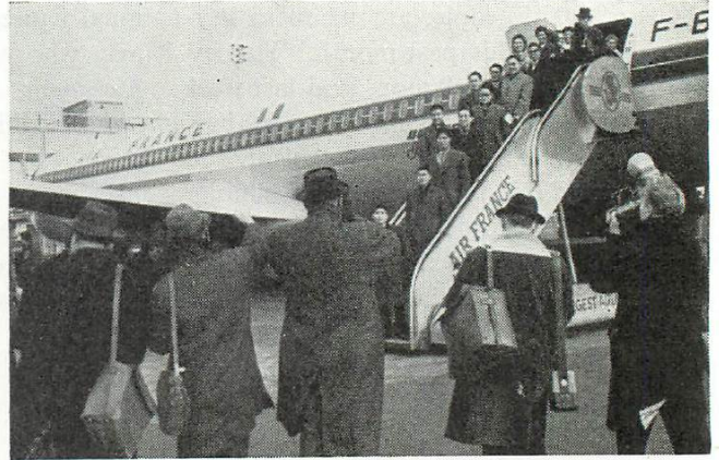
The cast of the Japanese play, 'The Tiger', arrive at New York's international airport