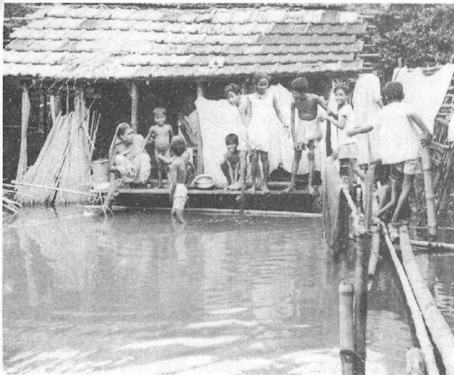
The slender bridge that linked Rishipara with the outside world

All this is for the Corporation to do, but it cannot unless the Government moves to regularise the colony right away. Fortunately for the refugees, Miss Ava Maity, Refugee and Relief Minister, has promised action within six months, perhaps caught in the wind of change that has started blowing.