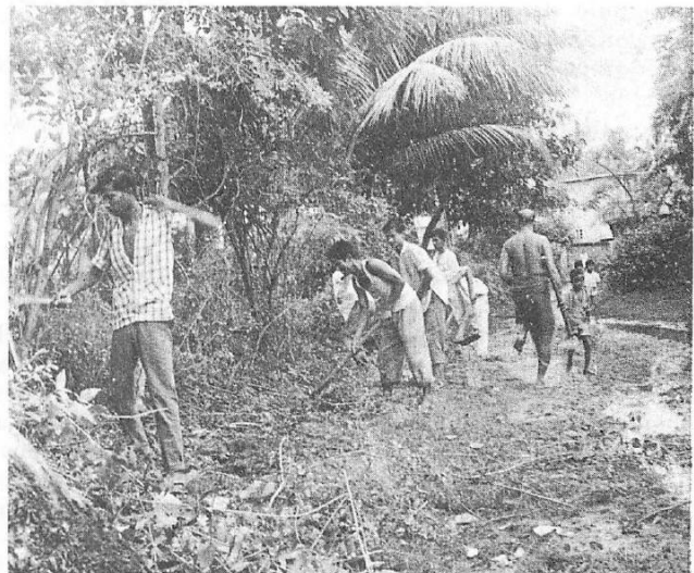
Youth at work clearing the marshes