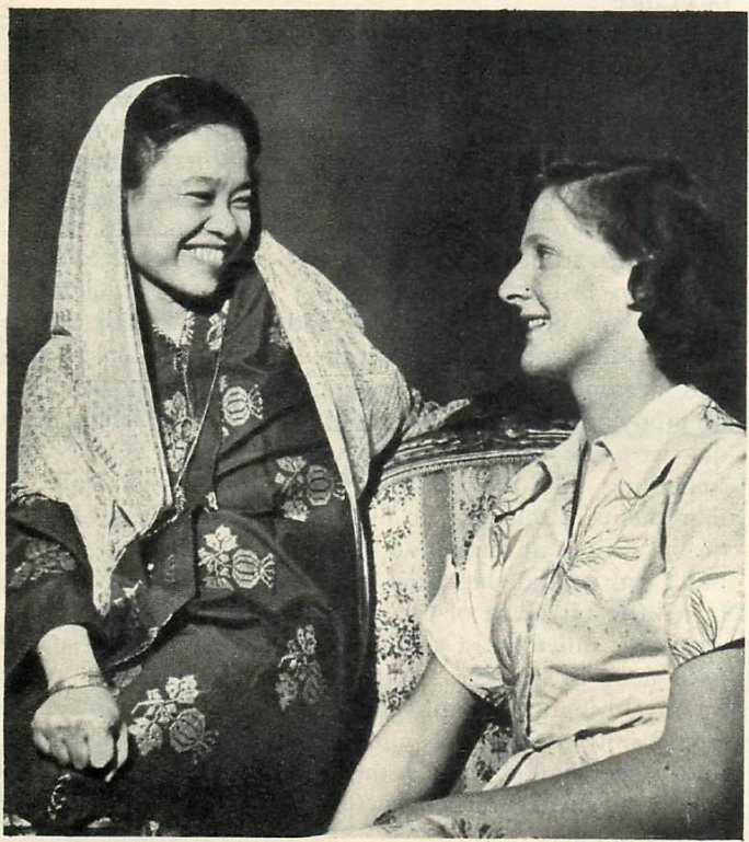
FINDS EAST CAN UNITE WITH WEST