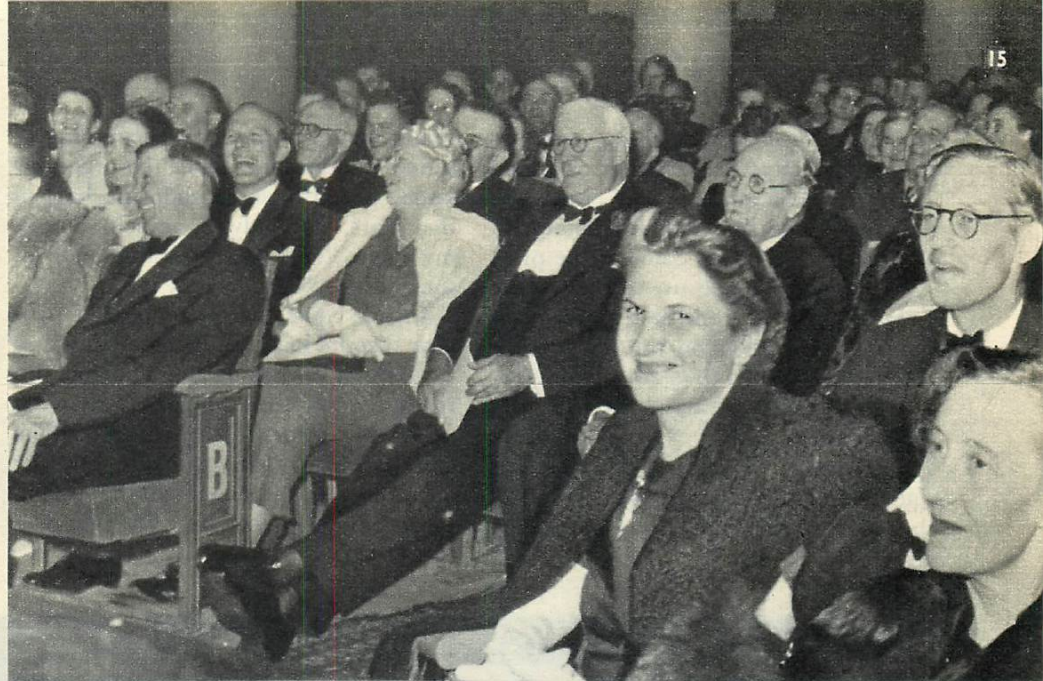
The Governor-General, centre, sponsored "The Forgotten Factor" in South Africa. Picture also shows the Speaker, President of the Senate and British High Commissioner

Although the fight of the mine workers against the Chamber of Mines seems to be leading to either deadlock or a revolt, a new and important factor during the past year has entered into this industry, and seems to be