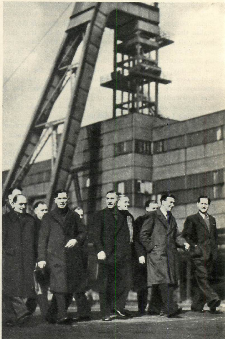
British miners and trade union leaders are welcomed in Germany when they bring news of an ideology for democracy. Here a party from the Midlands talks with works council representatives of the Hoesch mine as they move through the Ruhr

In Shanghai a taxi proprietor with fifty taxis was asked for more pay and then for severance money. He called his men together, told them they could divide up among