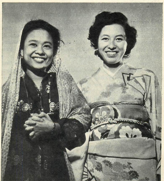
WHEN EAST UNITES WITH EAST