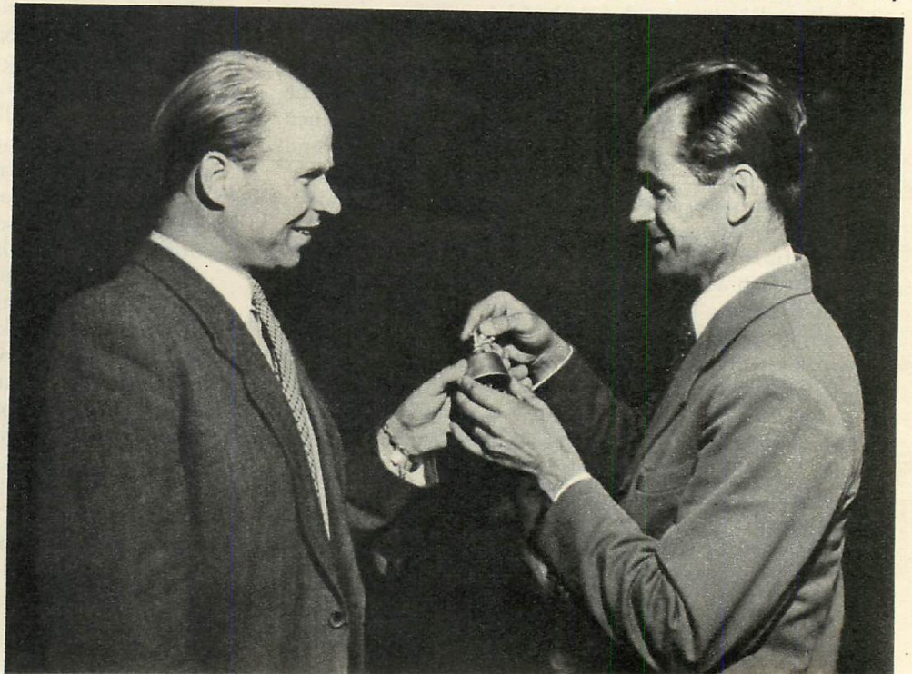
"This bell," said the Polish Count (left) "shall be a bell of peace between Poland and Germany." Silesian-born German (right) asked his forgiveness for a life-long hatred of his country