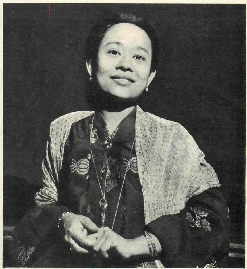
WITH AN ANSWER TO HATRED