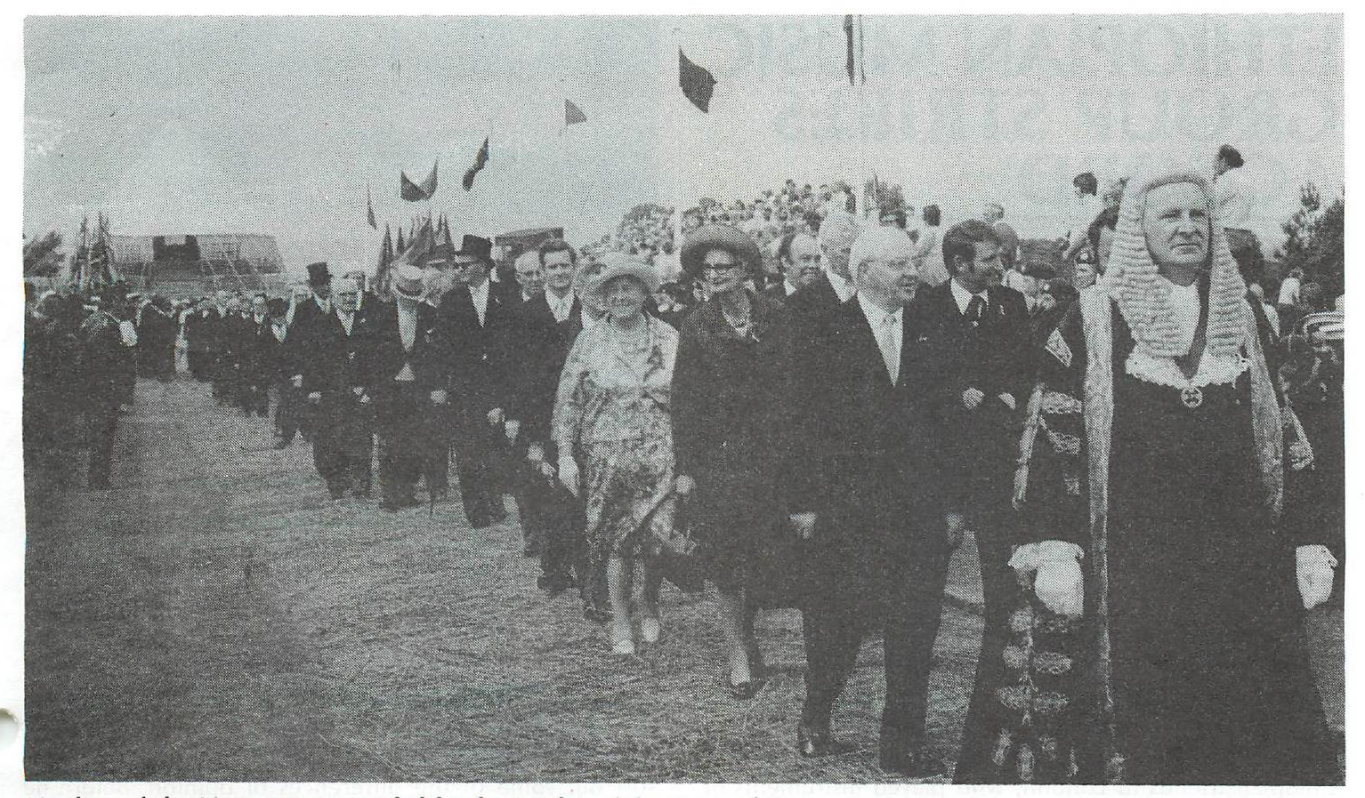
Members of the Manx government led by the Speaker of the House of Keys.

elected after the first five years and though not easy, it was tremendously satisfying. There were so many people for whom to care: first, my constituents, who knew my cottage door was always open for them. Alternatively I would go to them if they needed me. In return they gave me friendship and trust.