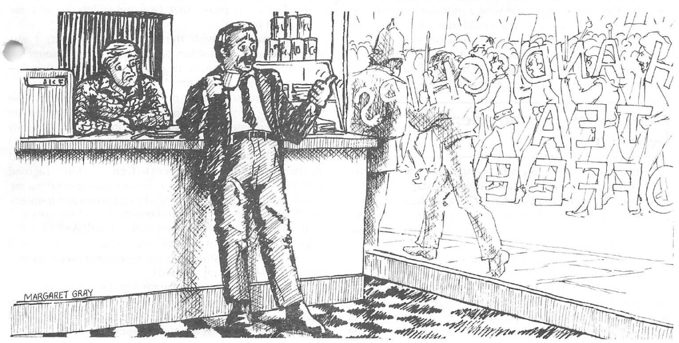
New World News 28 September 1985 3