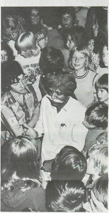
Schoolchildren from Steffisburg's primary and secondary schools crowd round Mama, the story teller in 'Song of Asia', to ask questions after a school matinee. The cast gave two performances in this Bernese town.