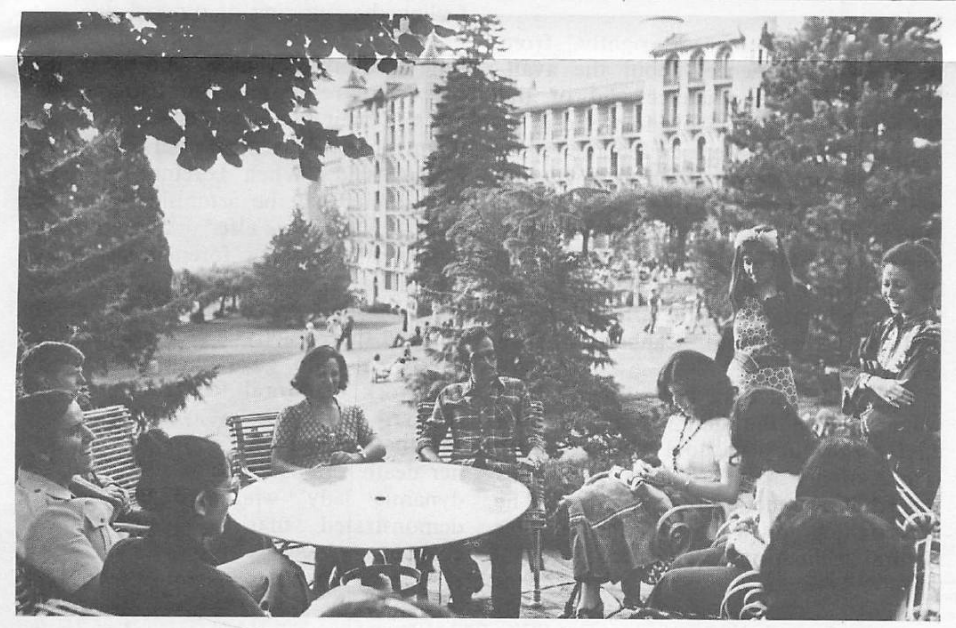
Egyptian students on the terrace at Mountain House, Caux

He concluded, 'We in Korea seriously believe MRA to be a historic mission entrusted upon our generation. In this spirit, we are devoting our best efforts.'