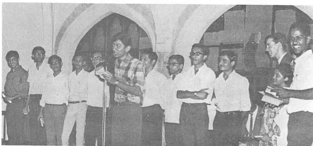
Bombay students speak at a training meeting in Wilson College