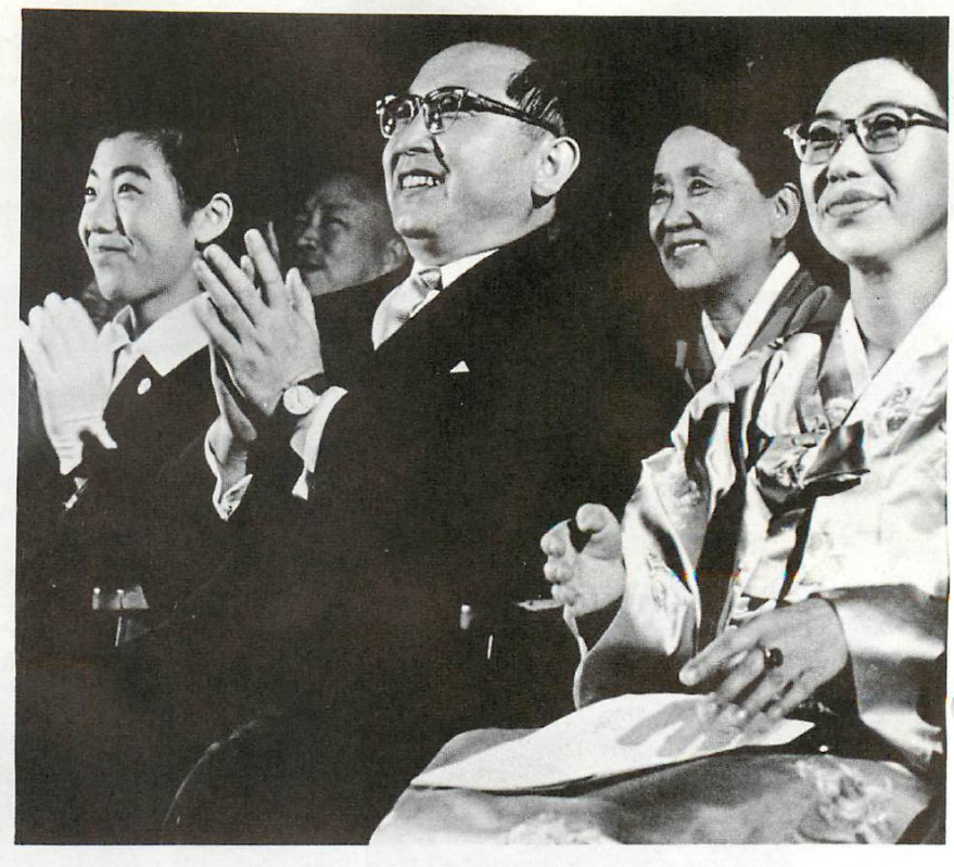
Korea's Premier sees 'Sing-Out '66' in Seoul with his family.

Ten daily papers in the area carried the message of the campaign to several million readers. Proceeds from