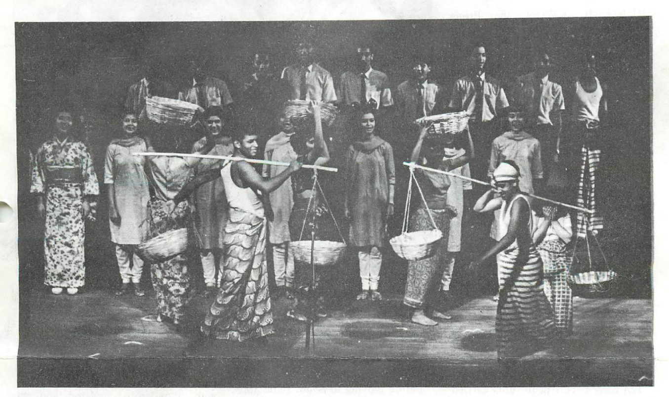
'Greatest musical staged by an Indian troupe,' wrote the 'Indian Express.' 'India Arise' will tour the nation.