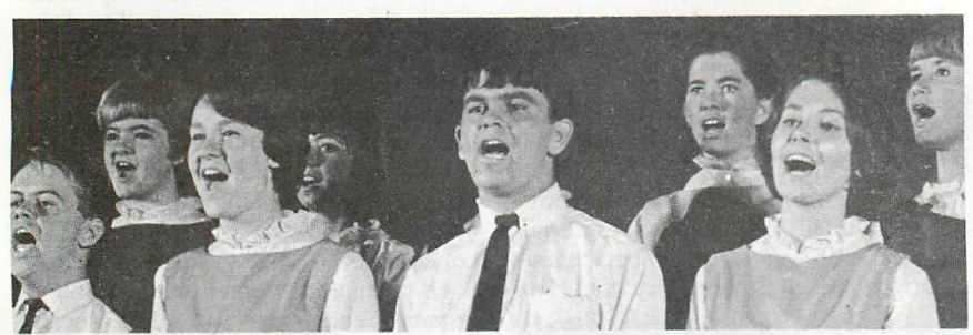
JOHANNESBURG: Students sing in Afrikaans and English at the première of their 'Springbok Stampede'. They challenge South Africa to take a full part in world affairs.

AT THIS TIME OF CRISIS FOR Nigerian unity students in Enugu demonstrated in a musical stage production the type of country they were determined to build. They said unity can only come through a change of motive and attitude in people, and that wealth comes from work. Nigeria could be made free from corruption, hate and tribalism. They announced there would be a national youth conference for MRA in Lagos in August.