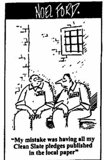
Cartoon from The Church Times reproduced with permission