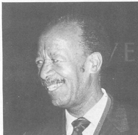
DR CEDRIC PHATUDI , Chief Minister of the Lebowa Homeland of South Africa, called upon delegates 'to end the fragmentation of the world.'

As a representative of the 'so-called Third World', he referred to recent events in Mozambique and Cyprus, and warned, 'Domestic affairs when mismanaged will very easily light up the whole world in warfare. Politicians are often caught in