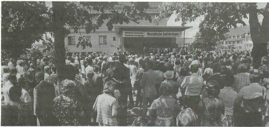
The demonstration in Freudenstadt square.