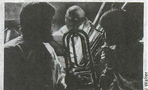
The Freiburg Orchestral Society provided the orchestra for the French oratorio.

TV carried a 30-minute programme about Caux, and both TV and radio news covered this world-reaching event that sprang from a blitz thought in the mind of a veteran editor, uncertain in health, but certain of God and of God's destiny for his country.