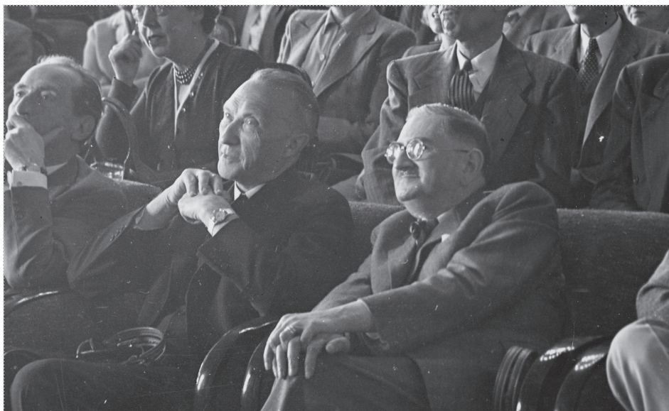
Konrad Adenauer (centre) in Caux.

In 1951, Adenauer wrote to Frank Buchman: "It is my conviction, too, that men and nations cannot outwardly enjoy stable relationships until they have been inwardly preparing for them. In this respect Moral Re-Armament has rendered great and lasting services... Very soon after the war Moral Re-Armament reached out a hand to the German people and helped them to make contact again with other nations... In recent months, too, we have seen the conclusion, after some difficult negotiations, of important international agreements. Here, also, I believe, Moral Re-Armament has played an invisible but effective part in bridging differences of opinion between negotiating parties, and has kept before them the objective of peaceful agreement in the search for the common good which is the true purpose of human life." Eleven members of his family visited Caux over the years.