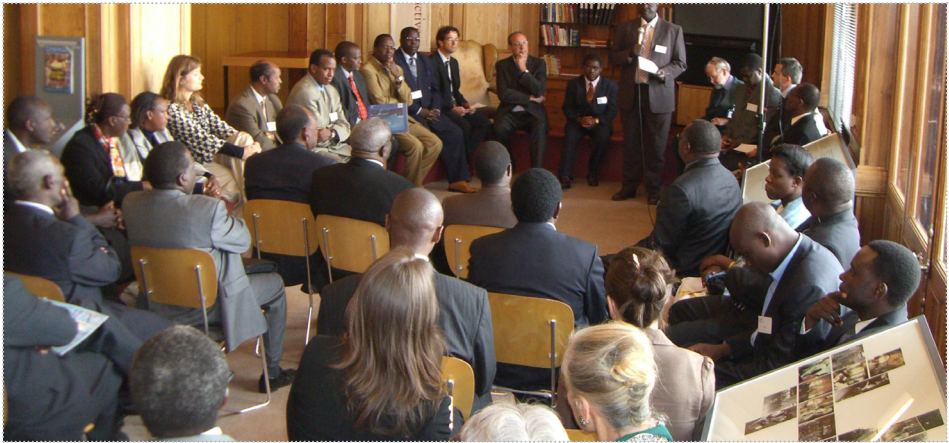
A Burundi round table in Caux.

Since 2000, Initiatives of Change has been working towards peace in the Great Lakes region of Africa, in Burundi, the Democratic Republic of Congo and Rwanda. The goal is not negotiations but to prepare minds and hearts so that peace agreements can be signed and implemented. Since 2003, the work has focused on Burundi, at the request of Burundians. This long and on-going process of “accompagnement” (walking alongside) the politicians, the military, the former guerrillas and civil society, is financed by the Swiss foreign ministry, and has had many of its meetings in Caux.