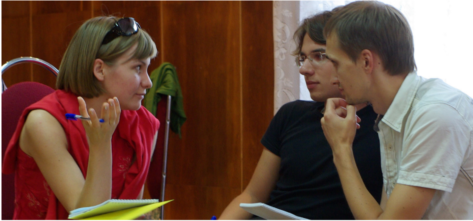
A foundations for Freedom visiting course.