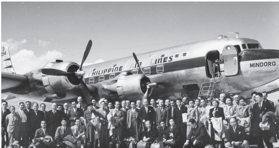
The Japanese delegation to Caux in 1950.

In June 1950 a delegation of 60 Japanese, among them politicians, trade unionists and industrialists, embarked from Caux on a tour of Europe and America. The delegation included the Mayors of Hiroshima and Nagasaki and seven provincial governors. The party also included seven women, almost unheard-of in such a male-dominated society. Before the group left Japan, the Nippon Times, an English language publication, carried an editorial on MRA, concluding, "If Japan can honestly repent her past misdeeds against her neighbours and can show sincerity of purpose to work unselfishly in the interest of world peace, the struggle to overcome the distrust and suspicion felt against her will be more than half won."