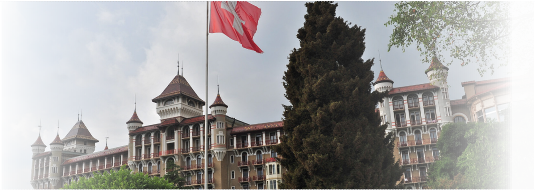
The Caux conference centre.