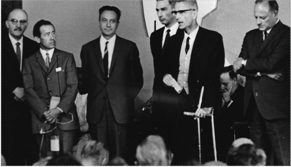
A delegation from South Tyrol/Alto Adige in Caux.