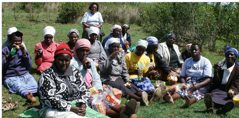
A peace circle in Kenya.

Peace Circles bring women of different backgrounds together in small groups to explore their peace-building potential, and have taken place in more than 30 countries.