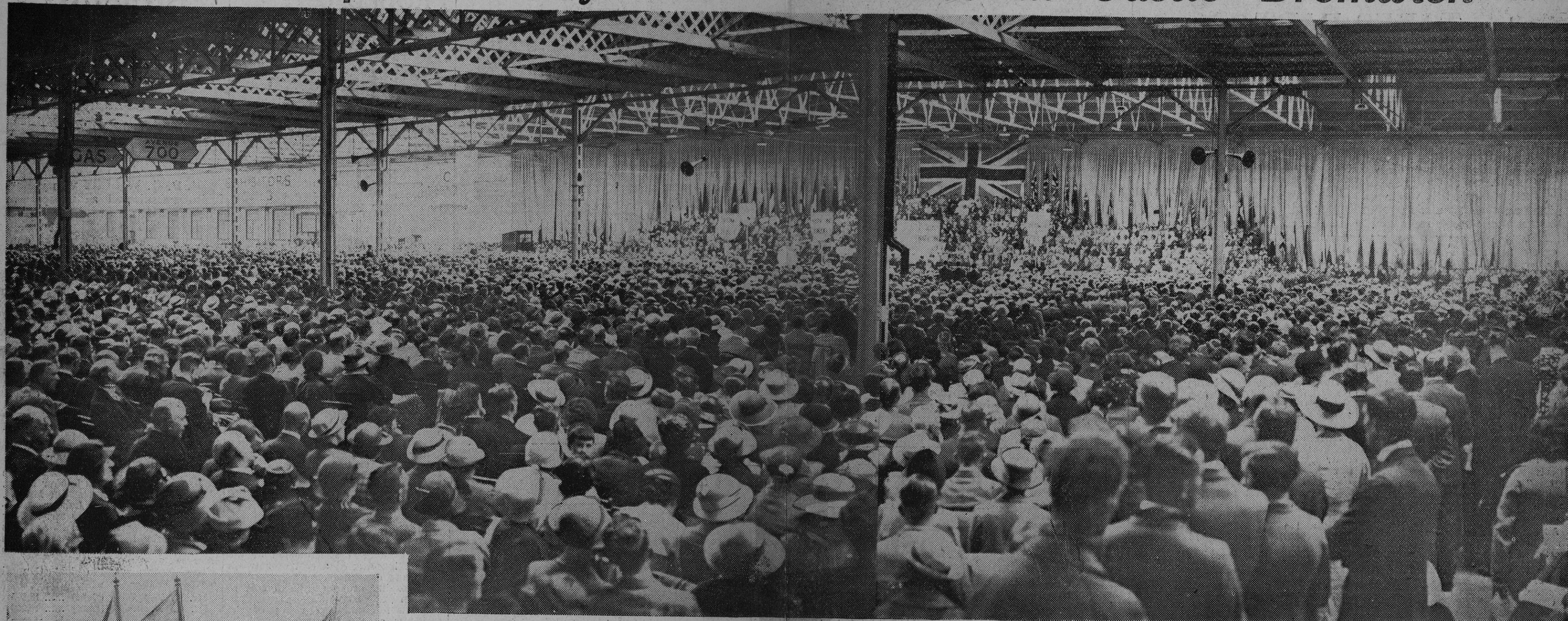
A GENERAL VIEW of the interior of the B.I.F. buildings at Castle Bromwich during the meeting of the Oxford Group yesterday. No fewer than 35 nationalities were represented in the vast audience. Left: Groupers from abroad, wearing national dress and carrying their banners.