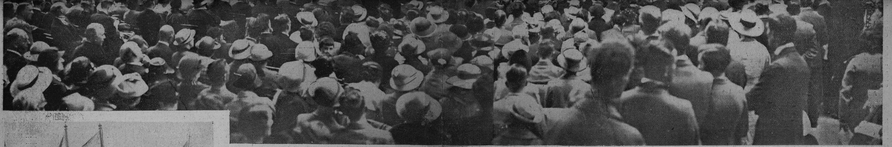
A GENERAL VIEW of the interior of the B.I.F. buildings at Castle Bromwich during the meeting of the Oxford Group yesterday. No fewer than 35 nationalities were represented in the vast audience. Left: Groupers from abroad, wearing national dress and carrying their banners.