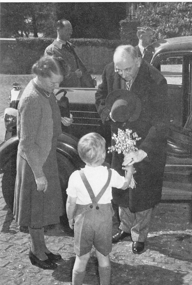
Dr. Frank Buchman arrives at Tirley Garth, 1946