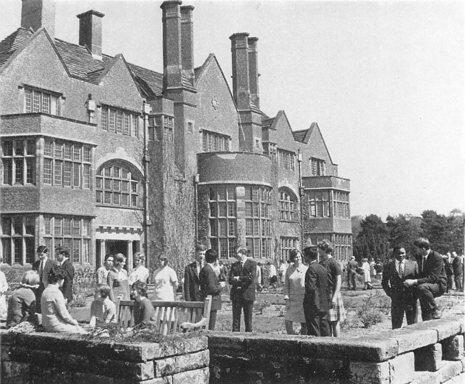
Young men and women from Australia, New Zealand, India, Malaysia, South Africa, Rhodesia, Turkey and Scandinavia taking part in a Moral Re-Armament training course at Tirley Garth, 1971