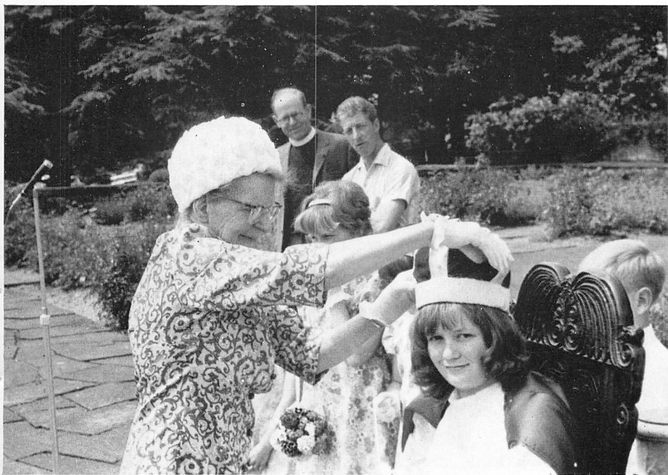
Crowning the Utkinton Rose Queen at Tirley Garth, 1969