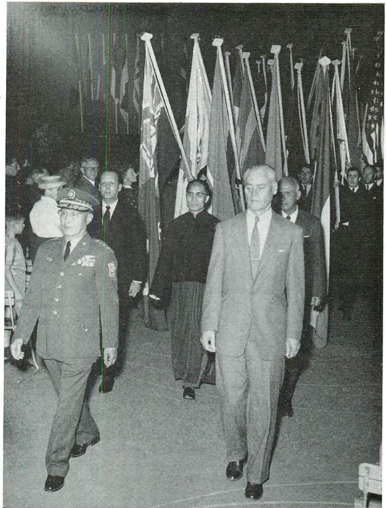
General Ho Ying-chin (left) with Marshal Tavora of Brazil led the representatives of 35 nations into the Lucerne demonstration last Sunday. (See page 121)

That same evening in Berne, the Swiss capital, so many came to the first night of The Crowning Experience that an additional performance had to be arranged at midnight. The film was introduced by two members of the Swiss General Staff and three Federal Members of Parliament.