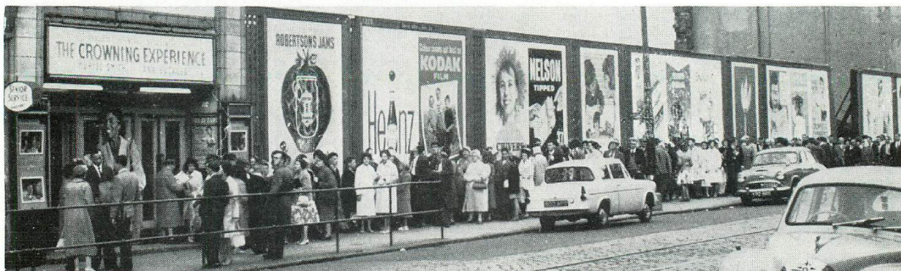
CLYDESIDE Crowds queue for 'The Crowning Experience' outside the Bank cinema, Clydeside. During the last three months the film has been showing to large audiences in Glasgow and along industrial Clydeside, home of Scottish shipbuilding.