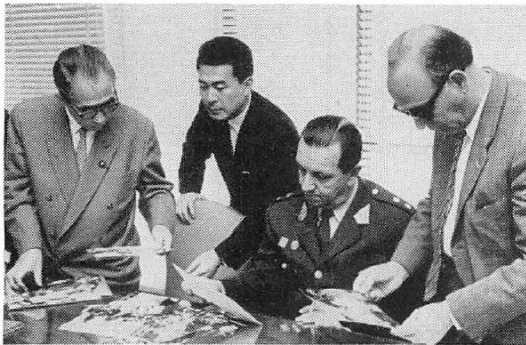
Chiba, who was chairman of the Japanese government's security committee in 1960, confers with security chiefs in Peru