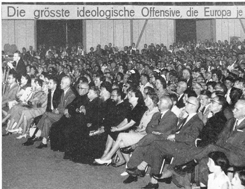
Vaterland , the Swiss Catholic daily, wrote: 'The people who filled every last seat in the Festival Hall on Sunday stayed for three hours, fascinated by the uniqueness of the occasion'

'With mankind on the brink we decided to start a major Moral Re-Armament offensive in our city so that we can play our part energetically in carrying on this revolution against the softening up of the West and the godlessness of Communism. The hour has struck and we have no time to lose. We fear the satanic power of evil, the threat of the destruction of mankind, but forget that the power of good is incomparably stronger.'