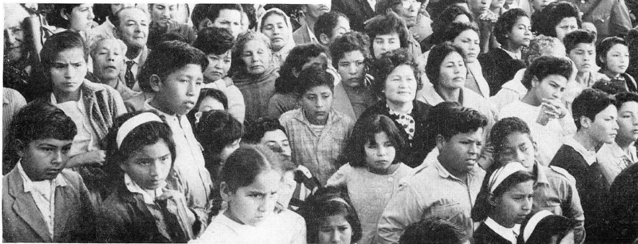
350,000 people have seen 'The Tiger' in Peru. This is part of a crowd of 5,000 who saw it in a suburb of Lima.