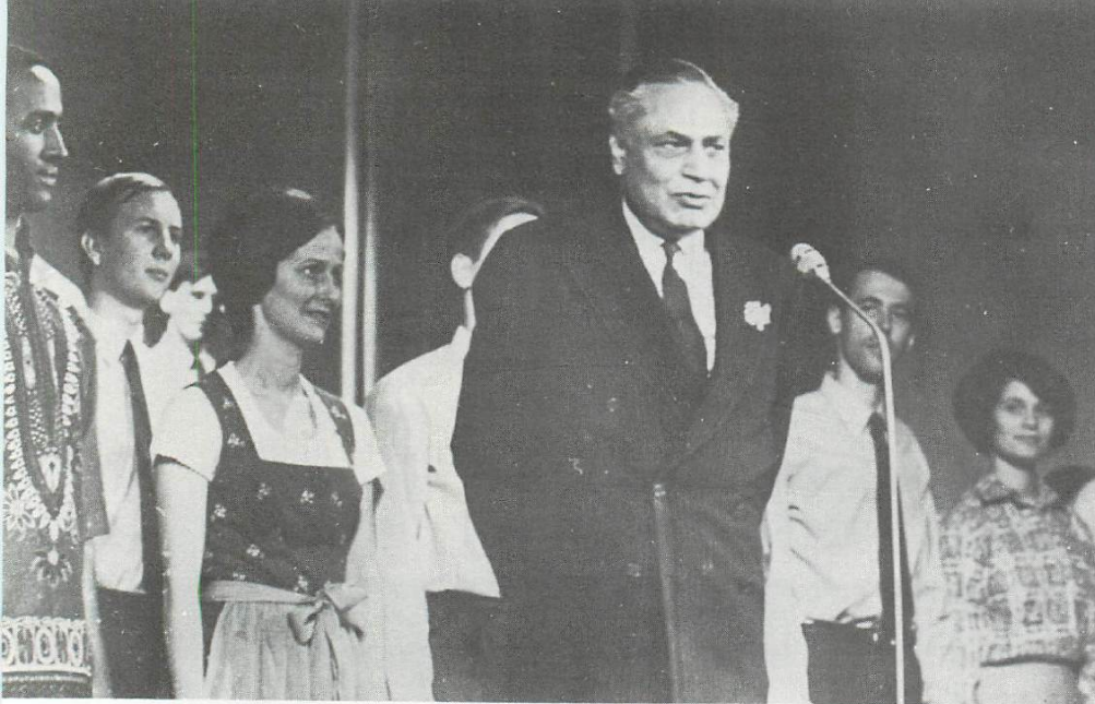
The Governor of Assam and Nagaland, B K Nehru, speaking from the stage after a performance of 'Anything to Declare?'