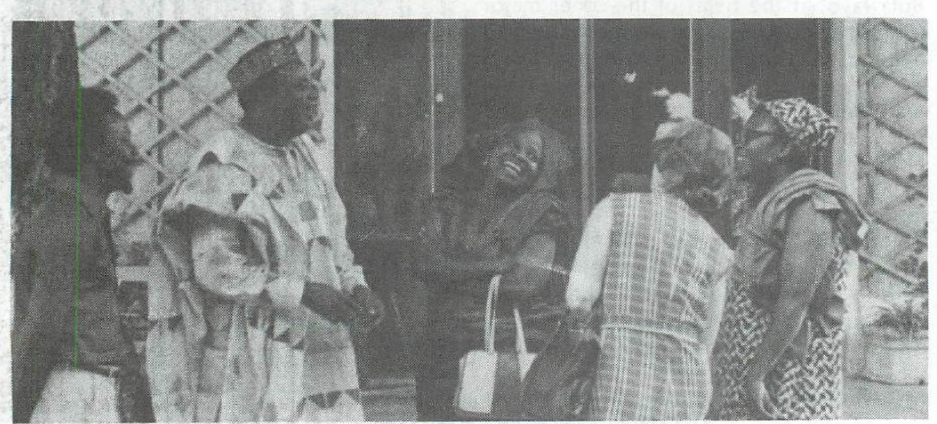
Nigerians at Caux

Alexis de Toqueville, the French writer of the last century, wrote in De la Democratie: 'In the life of democratic peoples there is a very dangerous phase of transition. If in one of these peoples the desire for material enjoyment grows quicker than education and the habit of freedom, the moment comes when they are completely fascinated by the sight of these new desired goods and almost lose their heads over them. Obsessed by the desire to become rich, they do not notice that there is a direct connection between the well-being of the individual and the progress of the whole. One does not need to rob such citizens of their rights; they will give them up quite voluntarily.'