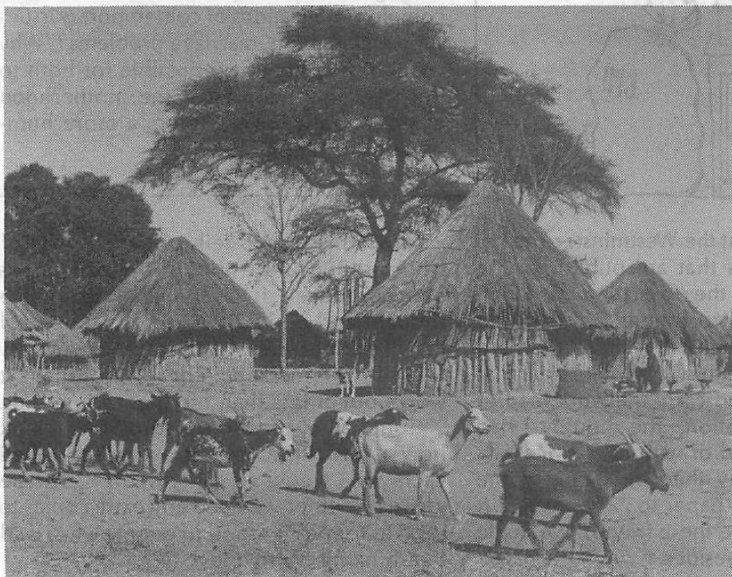
'He placed men and women in the world to develop it... co-creators with Himself'

This debate is a key issue for many countries in Africa—indeed throughout the world. Because of its importance we print here extracts from the pamphlet Marxism, Humanism and Christianity , which is a letter from the leaders of the Christian Churches in Zambia to all their members about 'Scientific Socialism'.