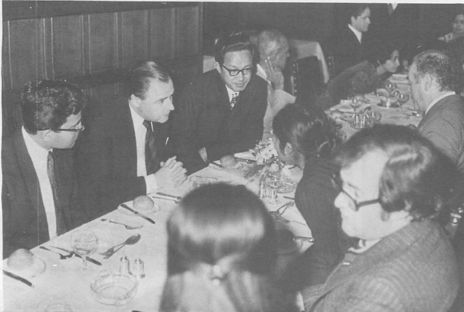
Lunch with Members of Parliament in the House of Commons.

Men in senior positions on the right and left of British life came in to discuss with the cast. Lord Hailsham told them that Britain was facing more than an economic problem. 'People are simply asking too much for themselves and giving too little to other people. That is not an economic problem. Britain must recover some convictions about