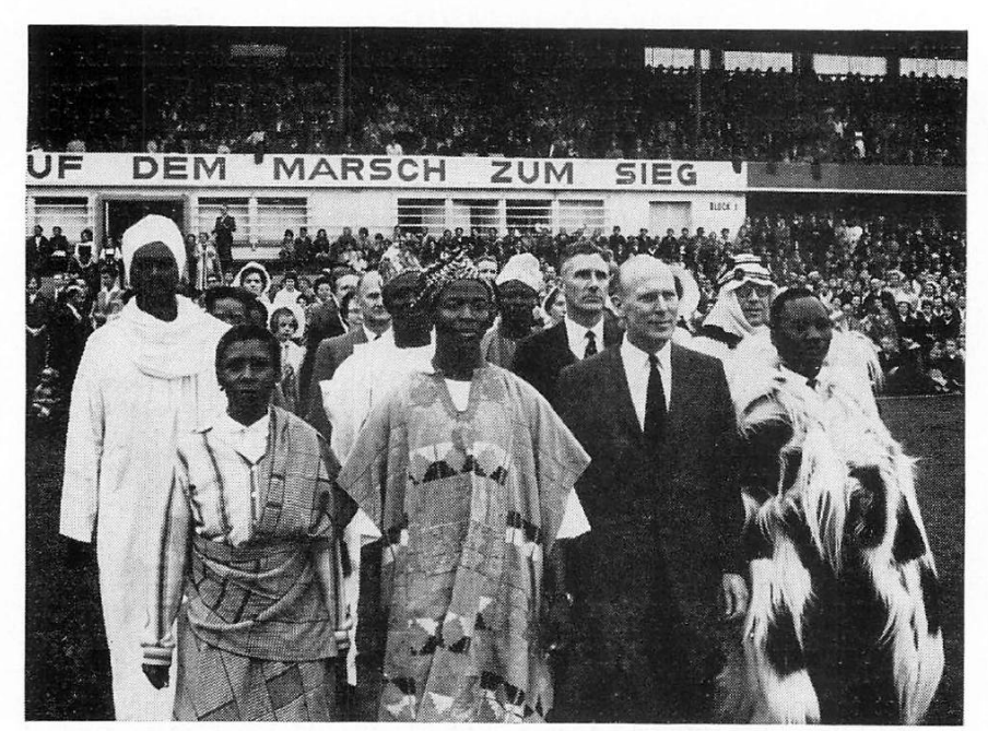
The African contingent enter the stadium. 'A revolution on the march to victory' reads the banner.