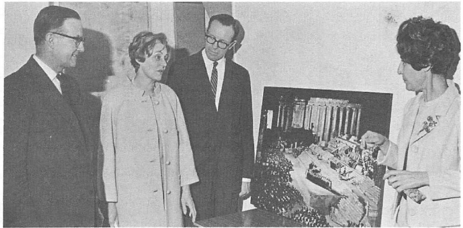
The Vice President of the Baalbeck International Festival Committee (right) presents photographic panels to the Westminster Theatre Arts Centre. Among those present are the Chairman of the Westminster Theatre Trustees; the wife of the Lebanese Ambassador; and the Director of the Arts Centre