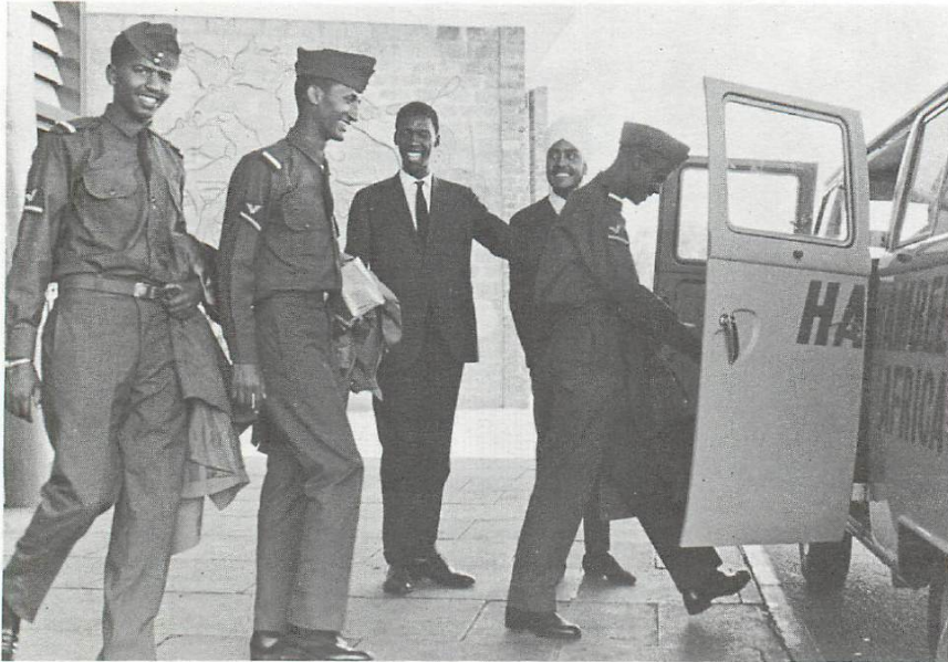
Ethiopian airmen, sent by the C-in-C of the Imperial Ethiopian Air Force, arrive in Nairobi to take part in MRA Action programme