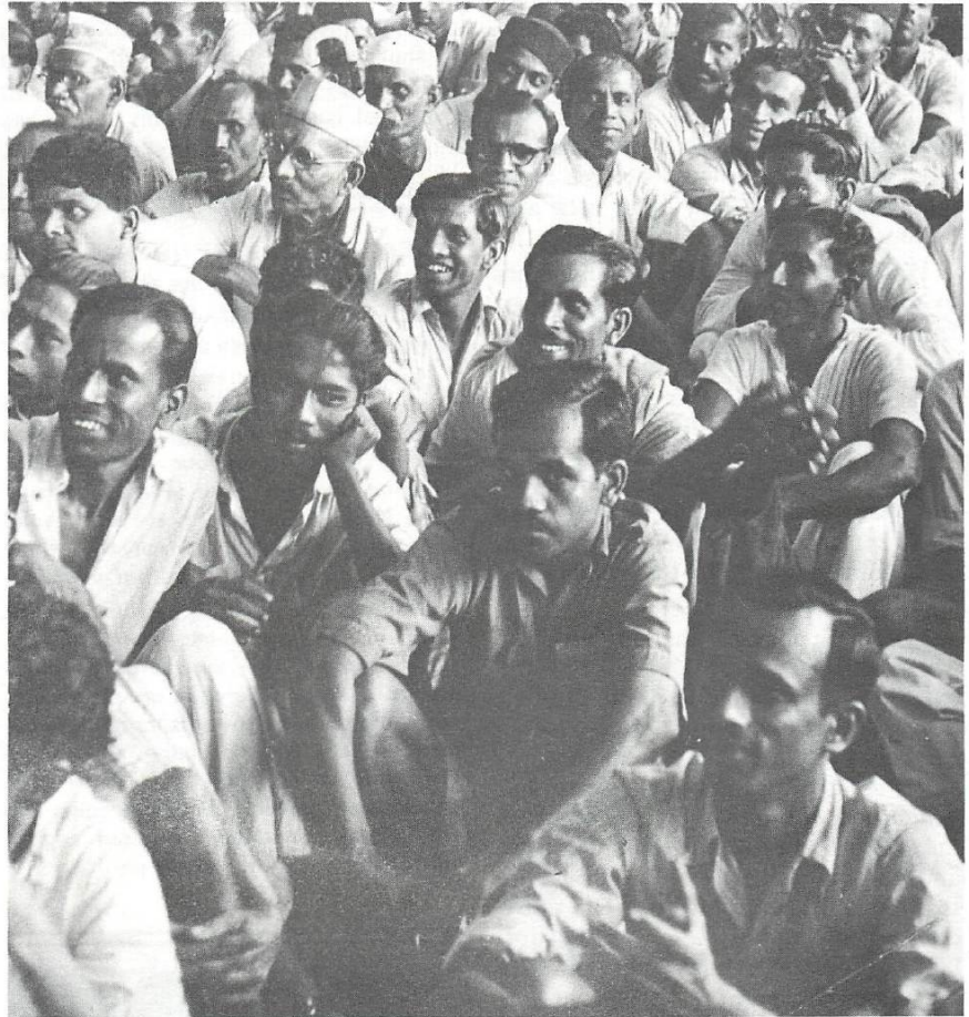
THE MILLIONS OF ASIA CANNOT BE TREATED LIKE PIECES OF WOOD OR MASSES OF STONE

Whoever is right or wrong and whoever wins in this struggle, the truth is that there are thousands of mothers