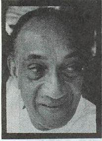
Sri Lanka—Temple Trees official residence of Prime Minister Premadasa Inset: President JR Jayewardene