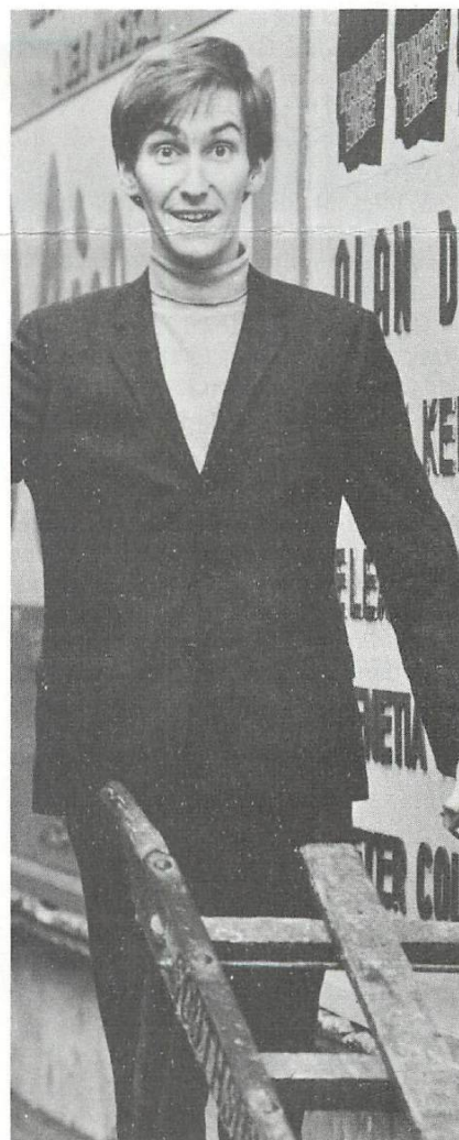
Pop star in Panto see page 2

Nine Kenya cabinet ministers and other national leaders in a statement reported in East African Standard .