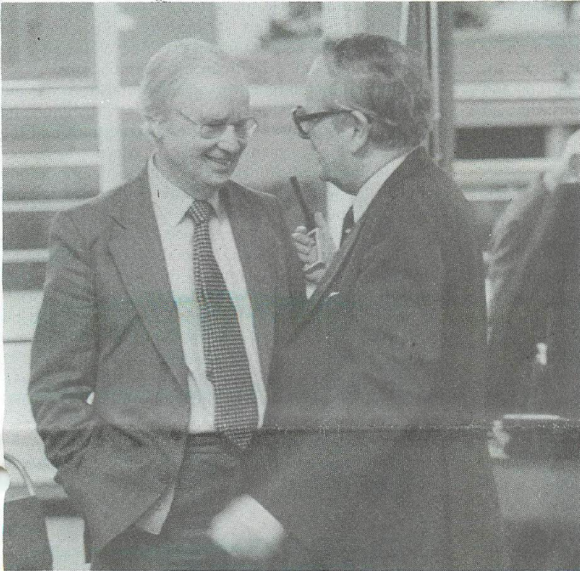
Dr Gwynfor Evans (left), Honorary President of Plaid Cymru, talks to the former Archbishop of Wales, Dr Gwilym O Williams.