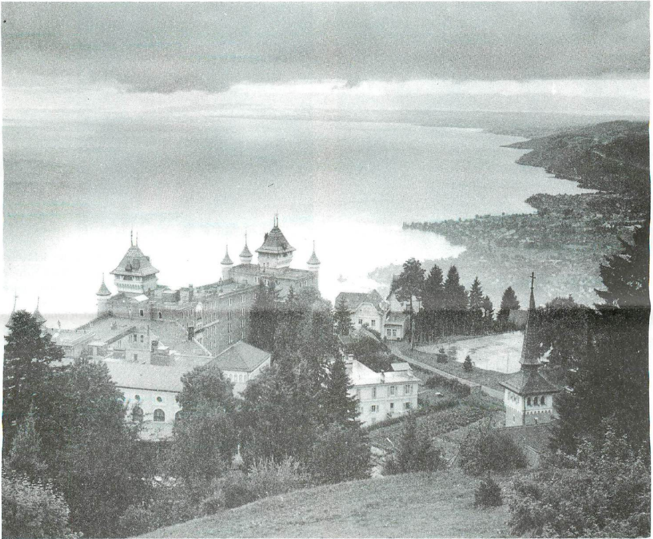
Mountain House, Caux, 3000 feet above Lake Geneva

other countries help us Americans find the will, strength and commitment to God to live up to the moral standards which we profess?