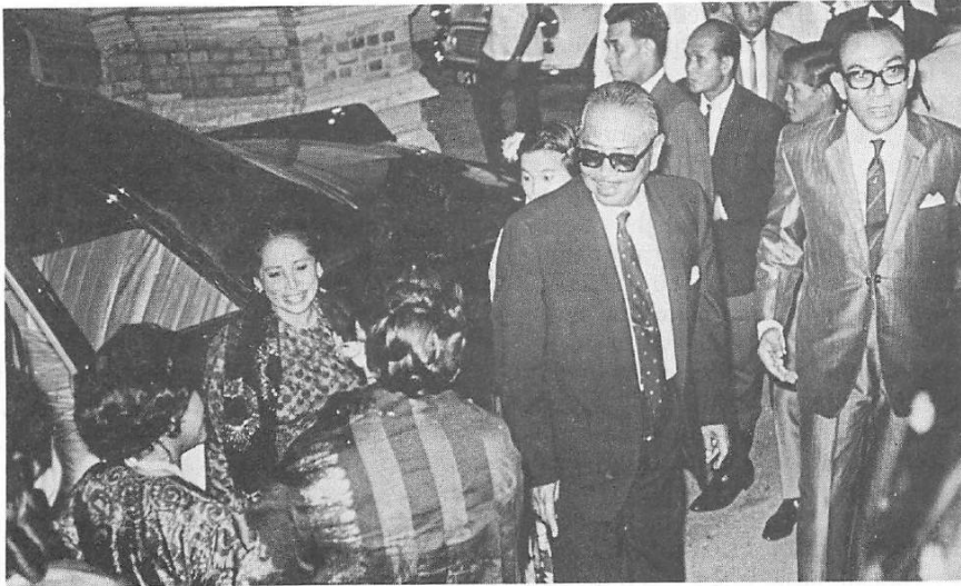
Left: Tunku Abdul Rahman, Prime Minister of Malaysia, arriving with his family at the Malaysian premiere of the international musical 'Anything to Declare?'

WHILE WAR SPREADS in the Indochina peninsular, in the Malay peninsular, scene of racial riots last year, Malays, Chinese and Indians have combined to bring an MRA international force to their country.