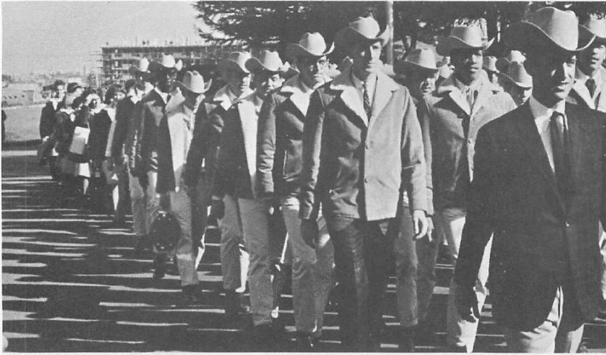
The cast arrives at a military base for one of the performances. Militant Marxist students have been won by the discipline of these young Americans