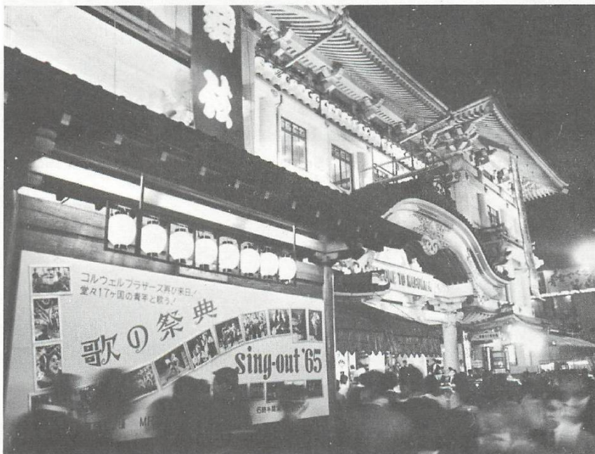
Top: 7,500 people including the Prime Minister and the US and USSR Ambassadors attended this performance of 'Sing-Out '65' in Tokyo's Olympic Gymnasium