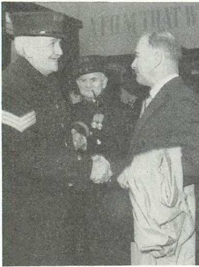
Seventy-six Chelsea pensioners arrive