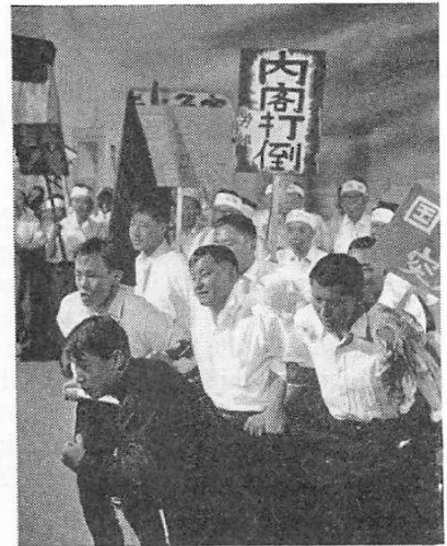
A scene from 'The Tiger,' drama of the Tokyo riots