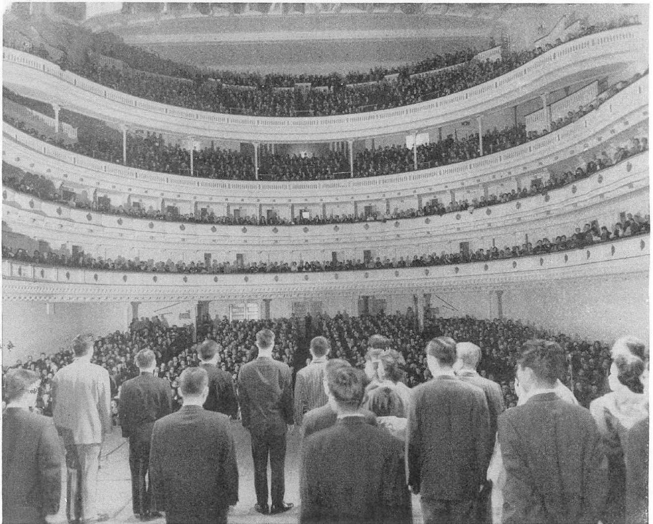
2,760 pack New York's Carnegie Hall for the American première of 'The Tiger'