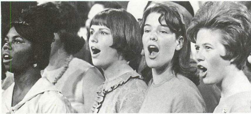
Negro and white Americans in Sing-out '65